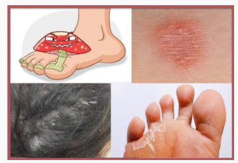
FREE Virtual Outcomes Training: Common Skin Conditions Modules Available

New online training modules around <u>Fungal Infections</u> and <u>Acne</u> are now available to access for all pharmacies in Kent.